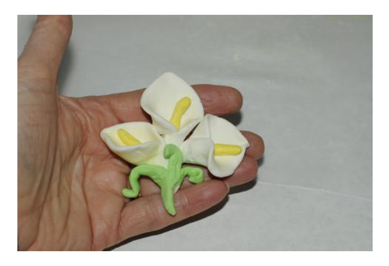
Set aside and let dry.

ACTÍVA Products 512 S. Garrett, Marshall, TX 75670 903-938-2224 www.activaproducts.com